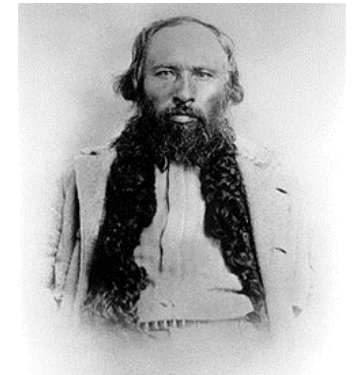
Gabriel Dumont (Resistance fighter) - Gabriel Dumont was a man of great chivalry and military skill, superbly adapted to the presettlement prairie life.