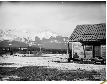
(Left): Looking North from Jasper House, 1872